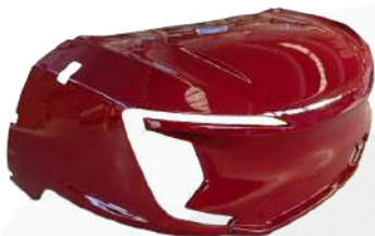
Red Wine Pearl