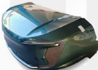
Hazy Titanium Blue Pearl