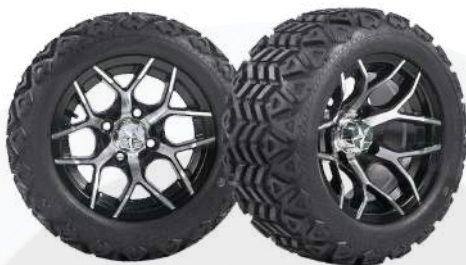
14 inch Mine tire