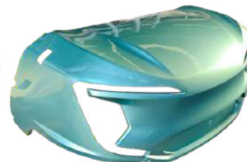
Breeze Blue-Green Pearl