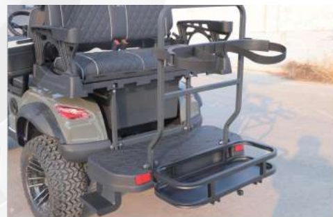
Rear Golf Bag Position