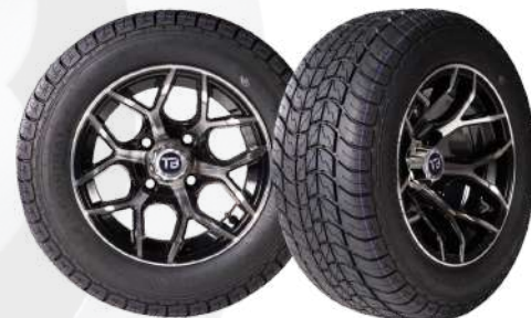
12 inch Grass tire