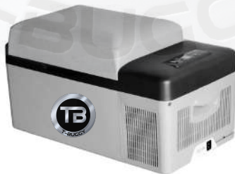
Electric car refrigerator