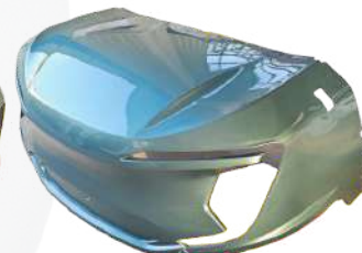
Light Hazy Titanium Blue Pearl