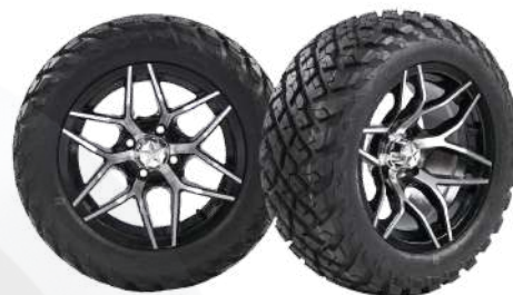
12 inch Mine tire