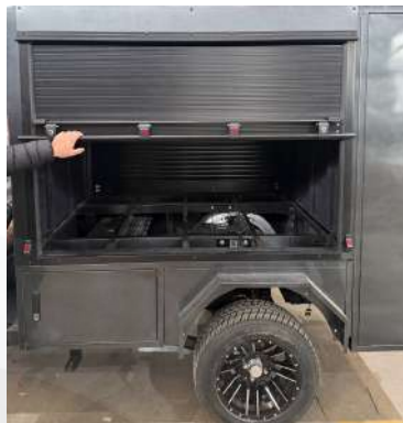
Cargo Box for: Trash, Beverage, Food... (Lateral View)