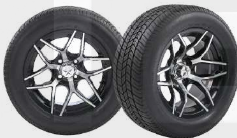
14 inch Grass tire