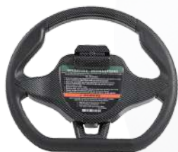
Wheel with scorecard holder