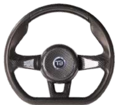
Standard steering wheel